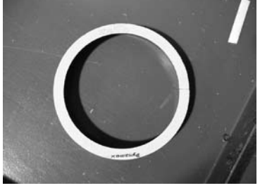
Yellow or ID groove around surface